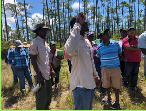
Agriculture teachers field trip into the pine forest