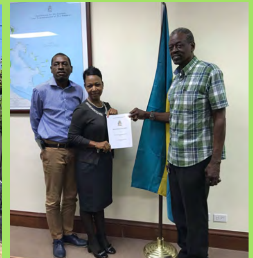
Heavenly Plam MOU Signing with the Forestry Unit