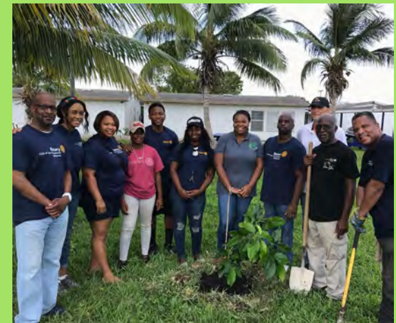
Peace Garden with Rotary Club at BTVI