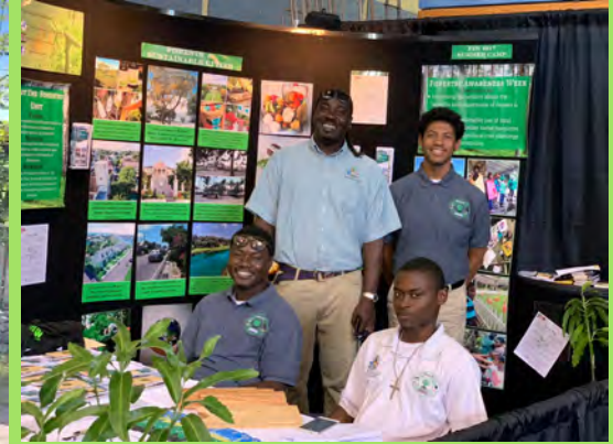
Forestry Exhibition Booth at World Food Day