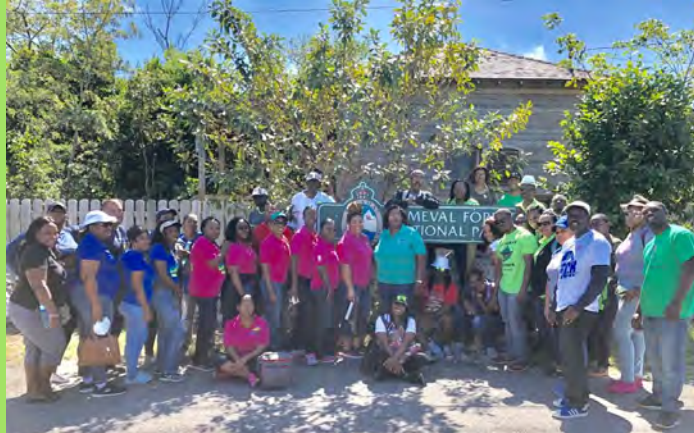
Field trip with teachers from Ministry of Education's Professional Development Workshop