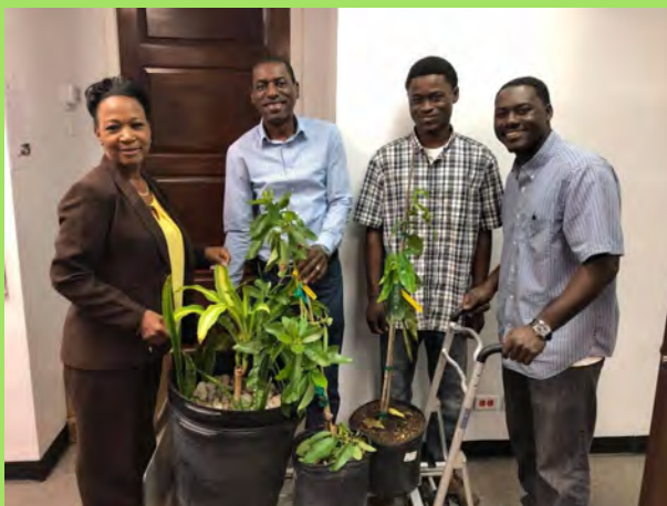
Couresty Call on the Permanent Secretary