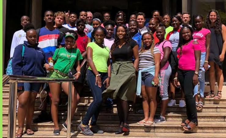
StemForce Program Courtesy call on the Forestry Unit