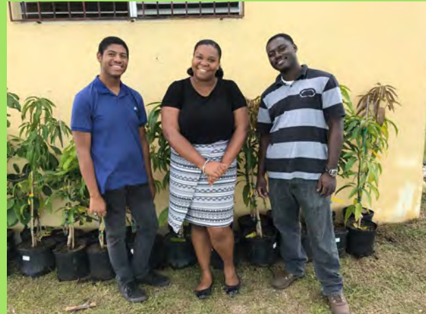
Donating Trees to Pinewood Parks