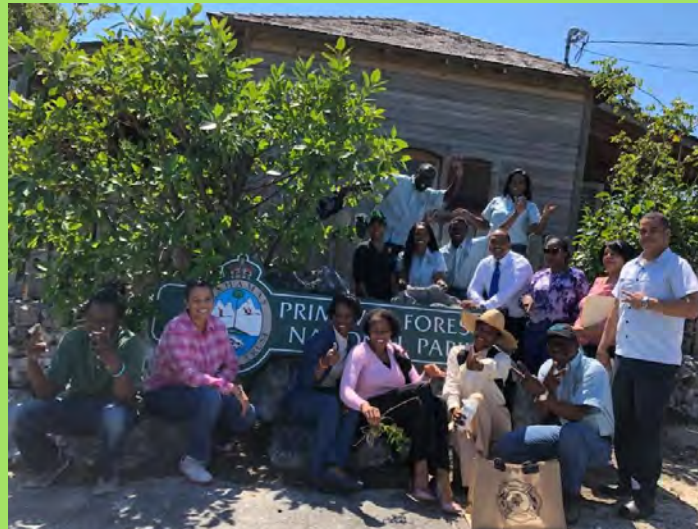
Administrative field trip with Ministry of Environment & Housing