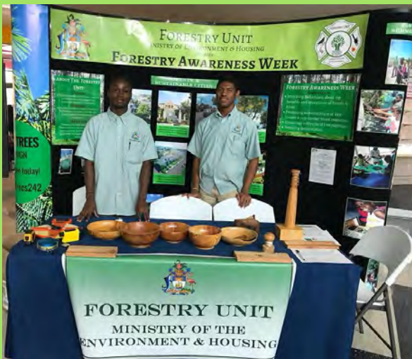
Forestry Exhibition Booth at The Mall at Marathon