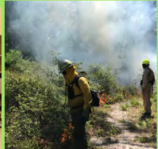
Burn Bosses engaged in a prescribe burn