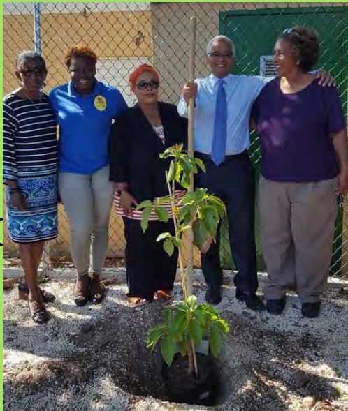
Hon. Dionisio D'Aguilar