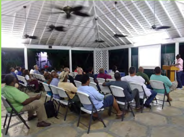
Wild Bird Hunting Town Meeting at Bahamas National Trust