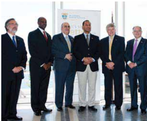
Bahamian delegation at Posidonia Shipping Conference, Greece.