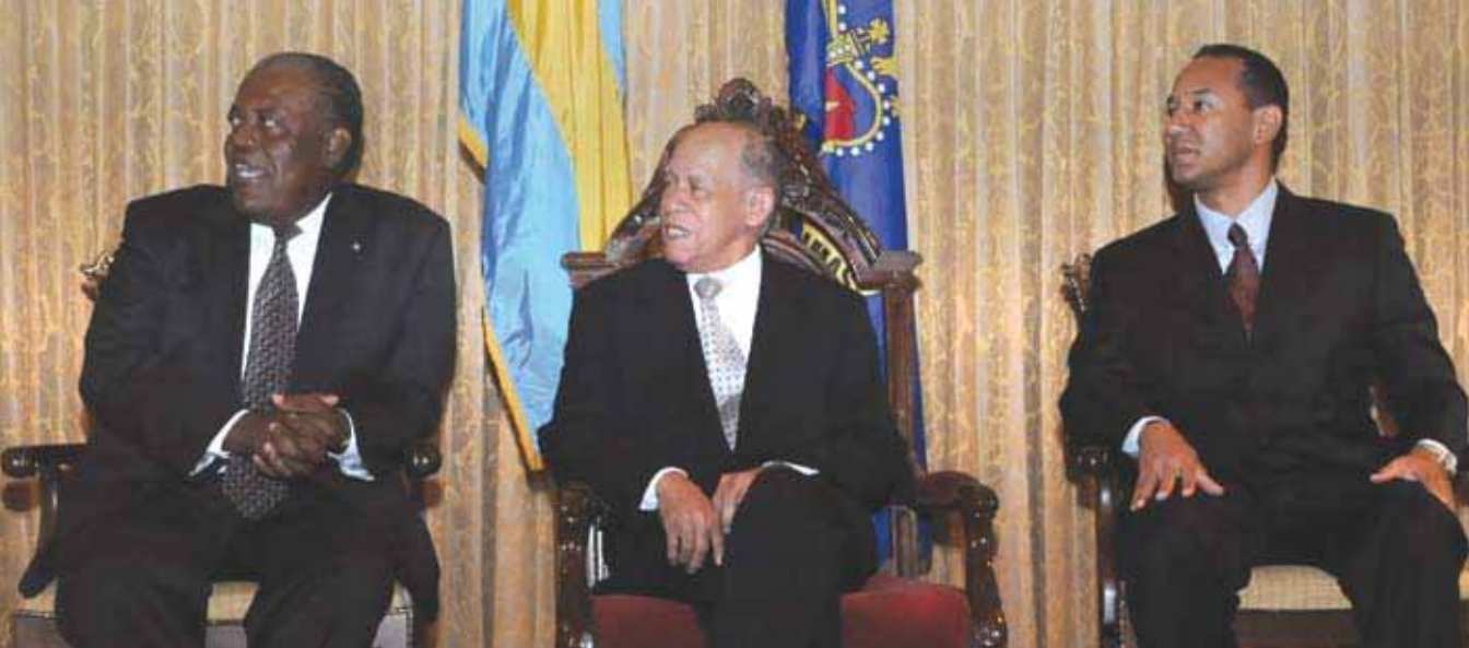
Official swearing in ceremony of John Delaney QC as Attorney General of The Bahamas