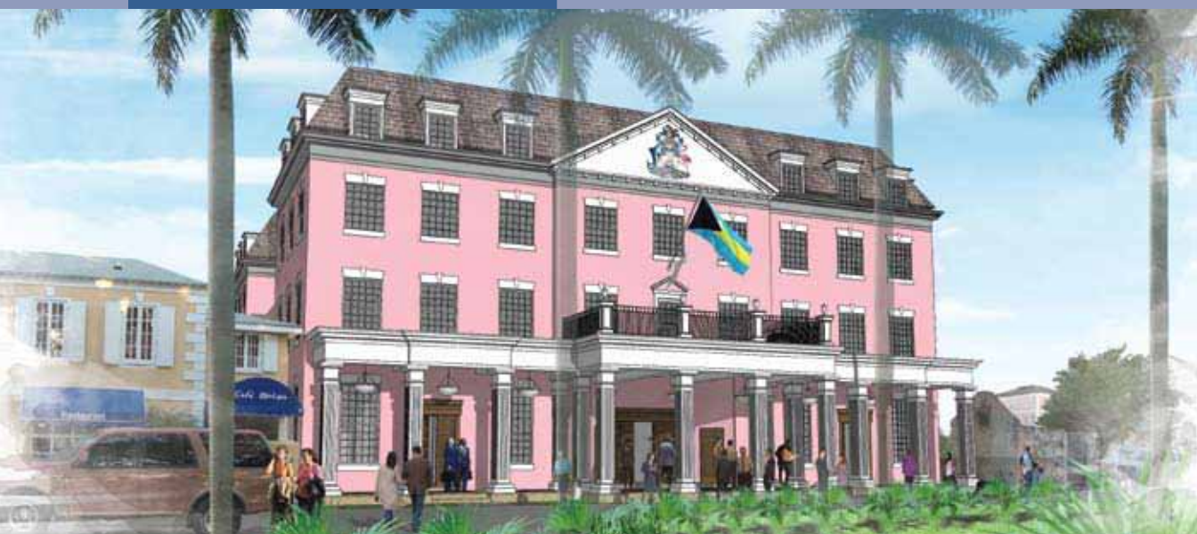
Artist rendering of new courts to be located in the former Ansbacher House.