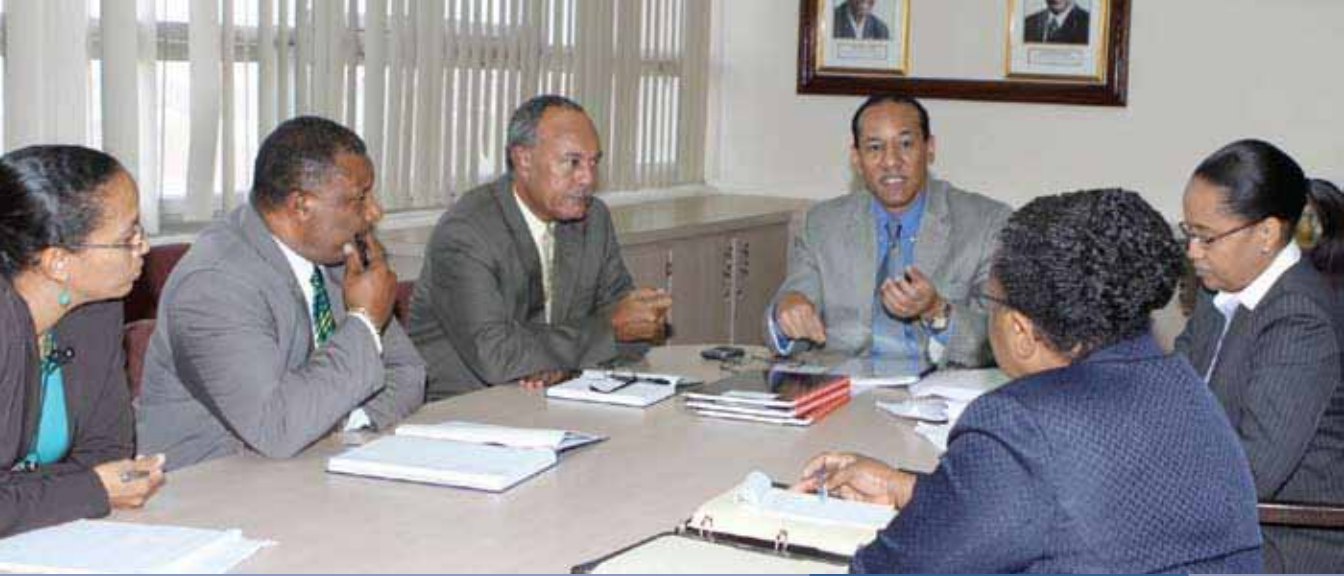
A planning session at the OAG.