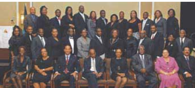
Eugene Dupuch Law School 2010 graduation ceremony.