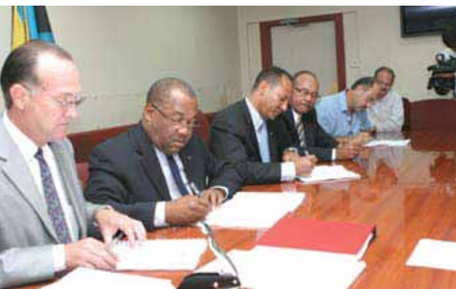
Contract signing for converting former Ansbacher House to courts.