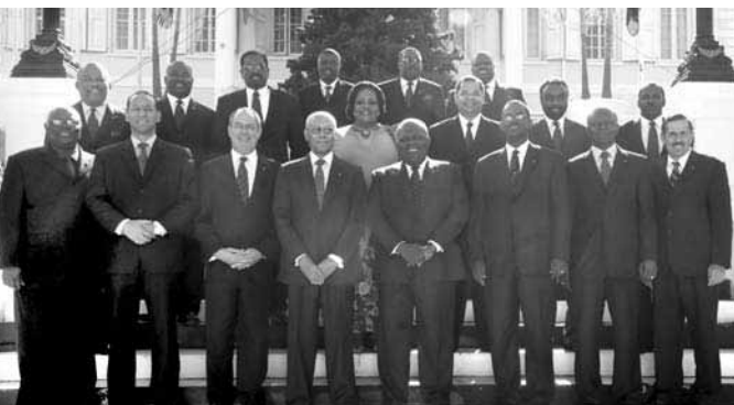
Cabinet hosted by Sir Arthur Foulkes, Governor General of The Bahamas

The powers of the Attorney-General are stated at Article 78 of the Constitution in the following terms: