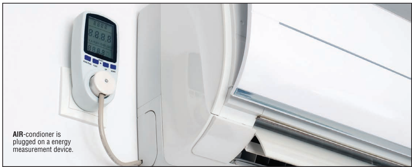
AIR-conditioner is plugged on a energy measurement device.

With the help of your energy consultant your energy Goals are identified.