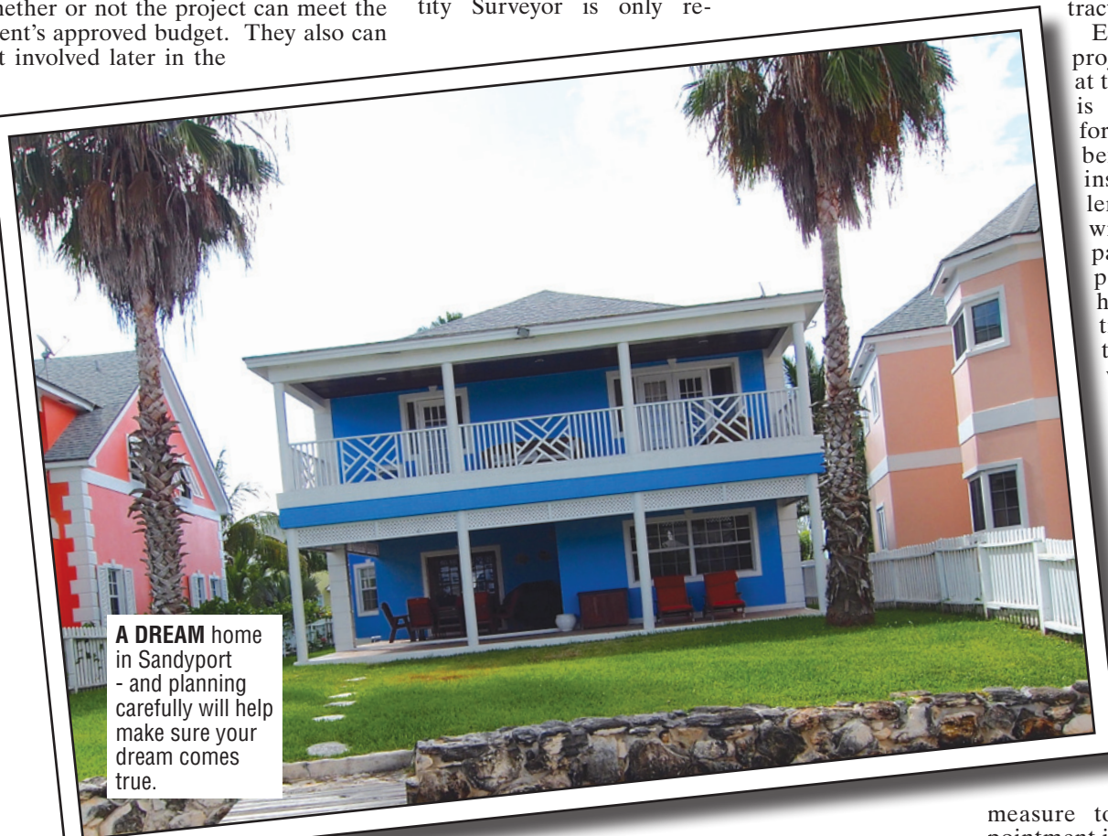
A DREAM home in Sandyport - and planning carefully will help make sure your dream comes true.

Without a Quantity Surveyor on your project, who are you relying on to give you best value in terms of cost? Be careful that even if someone says they can manage the money for you that their interest is not conflicted with those of the contractor or bank, and that they are