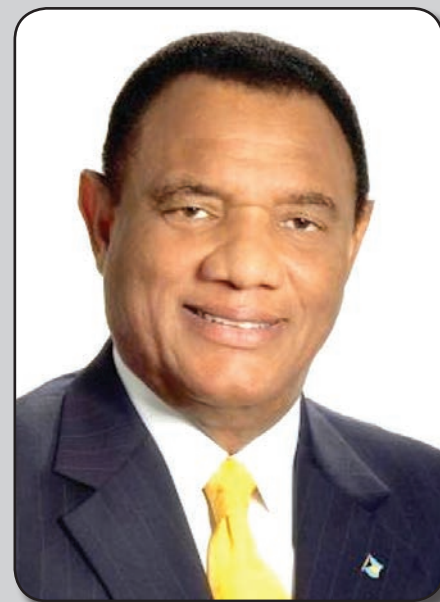
RT. HON. PERRY G. CHRISTIE, PRIME MINISTER AND MINISTER OF FINANCE

I encourage you all to carefully read the policy to learn as much as you can about our plans and the progress it will make in terms of an energy policy for The Bahamas.