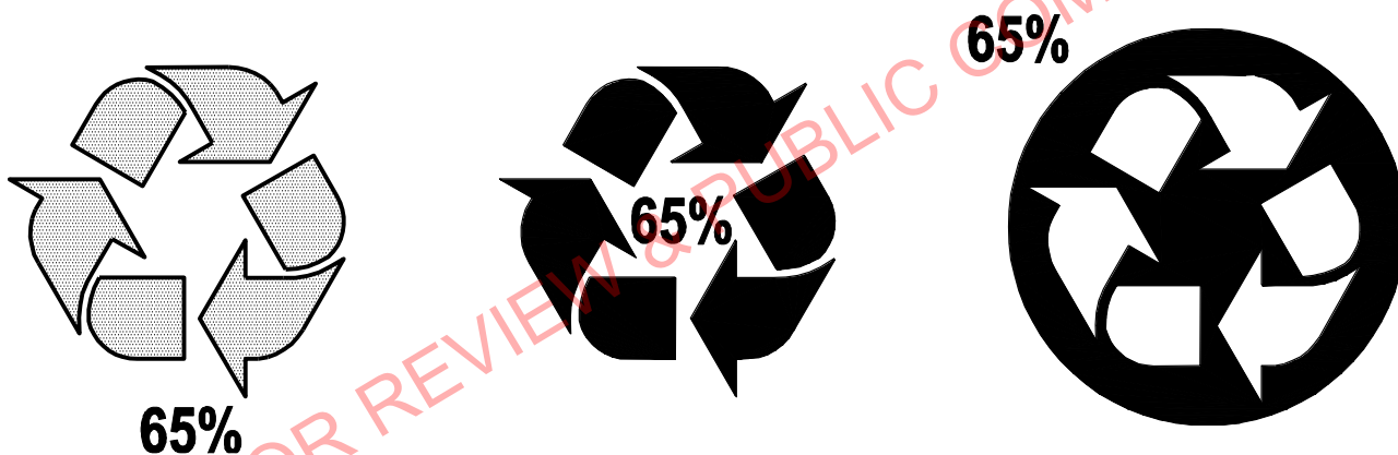
Figure 2 — Examples of acceptable locations of percentage value when using the Mobius loop to make claims about recycled content

7.8.3.5 Where a symbol is used it may be accompanied by material identification.